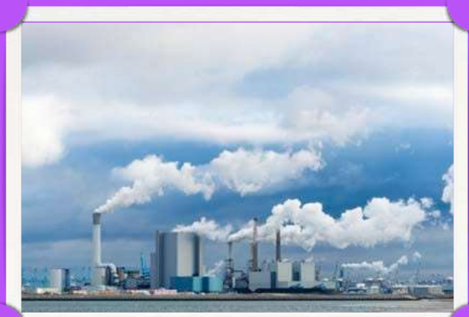
Coal and gas