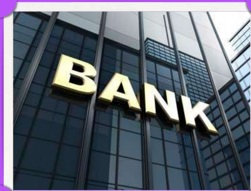
Banking and finance